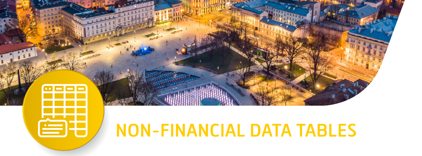
Table 1: Entities included in the consolidated financial statements